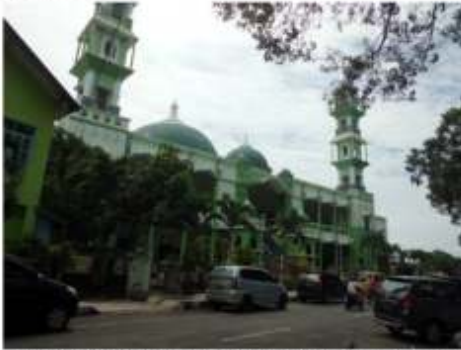
Picture 3. Masjid Jami' (Great Mosque) of Probolinggo

The Masjid Jami' (Great Mosque) of Probolinggo is currently a two-story modern mosque with a dome-shaped roof, complete with minarets on the left and right sides. Thus, this mosque can accommodate a larger congregation. This mosque dominates the western side of the square, and is the most important building on the west side.