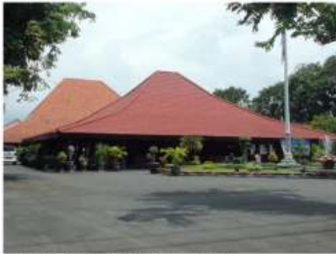
Picture 2. Regent Pendapa in south side

The South Side of Probolinggo alun-alun has been used as a building which is the center of government in Probolinggo since the Dutch era. At that time, Pendapa Regency was established as the official residence of the Regent. The regent as head of the Regency is an "extended arm" from the Dutch. The Regent is under the supervision of the resident who is above him. This is also a trace before the emergence of the city government.