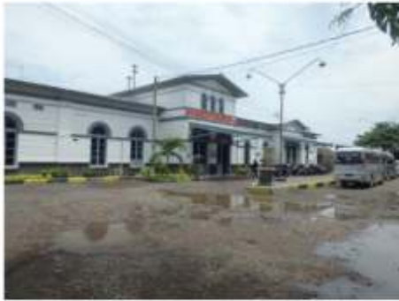
Picture 4. Train Station in North Side of Alun-alun

Besides that, the north side is also a place that has a business element. In the station area itself there is also a place to sell food that is quite crowded. While in the row of squares there are also street vendors who mostly sell food. Even so, the dominant one on the north side is still the Probolinggo train station which is the main marker and at the same time the easiest to be remembered by those who pass this place.