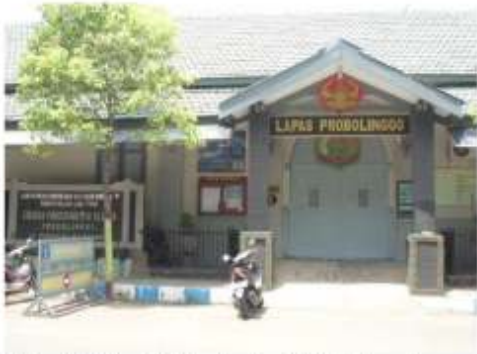
Picture 5. Prison Building in East Side of Alun-alun

The east side of Alun-alun of Probolinggo is also the other side too. Here there is a prison building which has also been around since the Dutch colonial period. This prison building is the dominant building on this east side. Prison was built as one of the elements of law enforcement, which in the Dutch colonial era might have been the meaning of "shock therapy" for the Probolinggo community in the past.