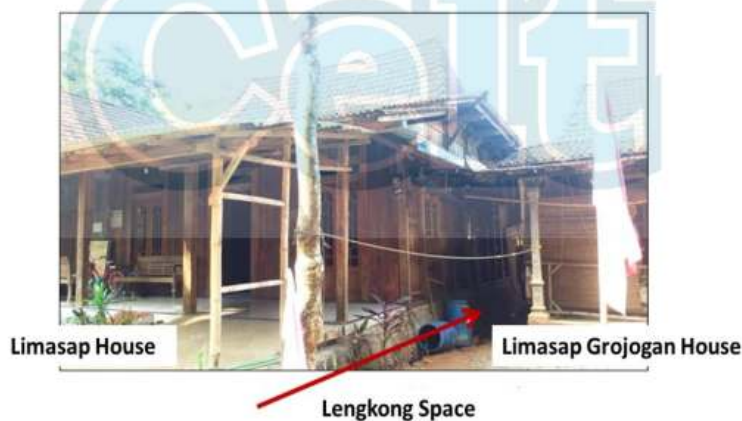
Figure 2: The Lengkong space between the Omah Limasap and Omah Limasap Grojogan (Setiohastorahmanto, 2023)

The Lengkong space is used by residents to shorten the distance and travel time, as well as animals that are used to passing will routinely cross the Lengkong . This is used by cattle herders. buffalo or goat to pass after finishing grazing. It is possible that wild animals also crossed.