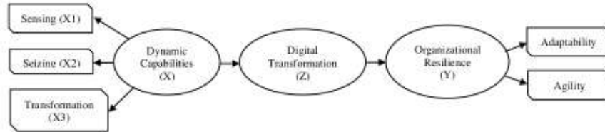
Fig. 1 Research Model

As for data analysis using descriptive statistical data analysis and Partial Least Square SEM, this analysis is one of the analyzes used to develop or estimate an existing theory (Sarwono, J and Narimawati, 2015). In this study, the use of the PLS structural model was assisted by the SmartPLS 3.0 software. Based on this explanation, the research model for this research is as follows.