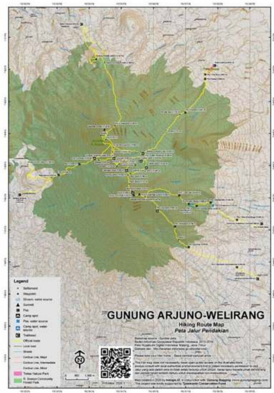
Fig. 3. Location of the research participants especially from Tretes Route ('peta-jalur-pendakian-gunung-arjuno-welirang.pdf', no date; Dan, 2016)