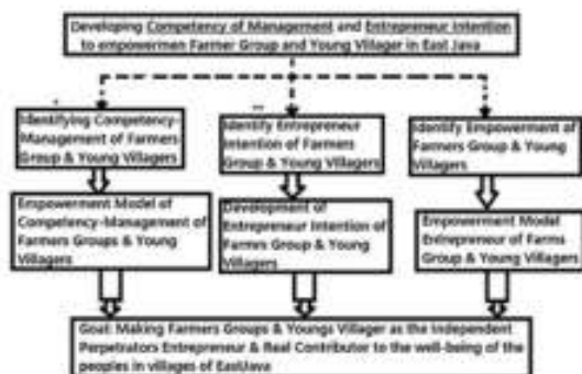
Fig. 1. Roadmap / Concept of our research (Direktorat Riset dan Pengabdian Masyarakat Direktorat Jenderal Riset dan Pengembangan Kementerian Riset, Teknologi, 2019), parts of * and ** is reported in this paper works

in life as the strategic planned and processed by (Dinas pertanian jawa timur, 2014; PEMERINTAH PROVINSI JAWA TL, 2015; Dinas Pertanian Provinsi Jawa Timur, 2016; Bappeda, 2017) which is supported by our research concept shown in figure 1.