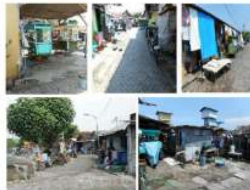
Picture 6. Women's occupation in Kalisari's Fishermen Settlement