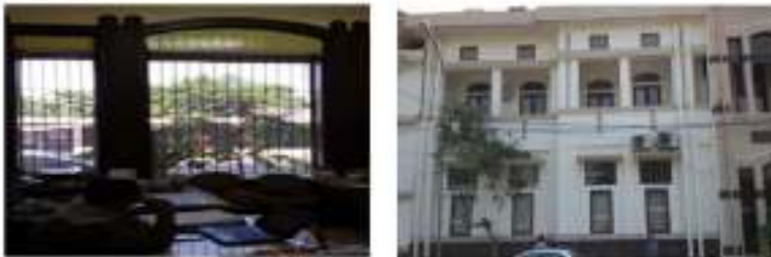
Figure 6 The type of ventilations of PTPN X Building/Source of observation research.