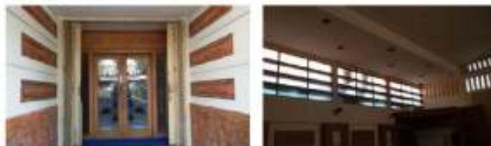
Figure 7 The multipurpose room PTPN X