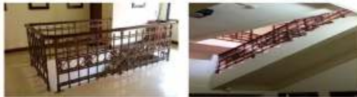
Figure 4 The stairways at PTPN X building/Source of observation research.