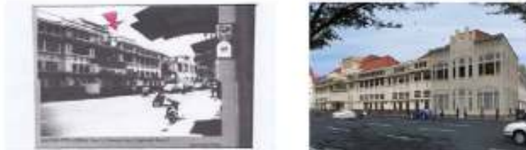
Figure 12 The PIPN X Building (old and new)/Source of observation research.

The existence of this building that reflects the historic situation remains steady, so that the colonial era can be enjoyed as a cultural asset that represents the actual conditions of the former Dutch colonial era, in Surabaya city, as shown in Figure 12 [5].