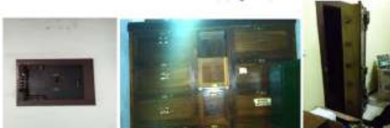
Figure 5 The bunker at PTPN X building

Dutch plantation office, and to protect the employees from external disturbances (there is a way to escape for employees that flow to the river which is located in outside of the office) (Figure 5).