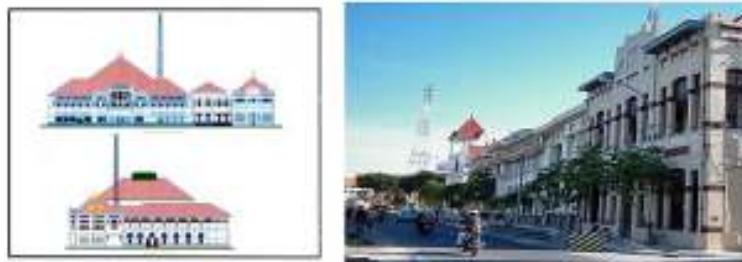
Figure 1 PTPN X building (the new design)/Source of observation research.

markets are getting higher and higher from time to time. Unfortunately, such great tourism potency has been neglected by the tourism stakeholders, such as the government and the industries. One of the heritage buildings in Surabaya, going by the name PTPN X (PT Perkebunan Nusantara X) as shown in Figure 1, that is located at Jalan Jembatan Merah , a state-owned agricultural business office, was damaged by fire. Its damage level was 60% due to suspected electrical short-circuit. This unfortunate incident can actually be avoided if the government has greater care and appreciation for these buildings by giving necessary preventive actions and taking precautions in protecting the buildings from fire. Recently, there has been increased growing concern from the community, represented by a group of university students, to push the government to protect and preserve heritage buildings such as PTPN X, among others, which are important and potential tourism and education heritages.