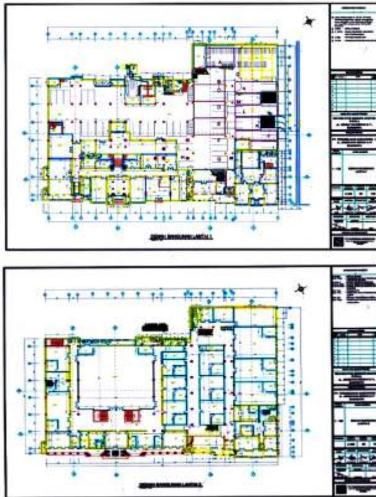
Figure 3 PTPN X Building (the first and the second floor design), by CV. Arsitektur Spasial Nusa Consultant [4].

heritage buildings with similar European architecture, such as other PTPN buildings, is necessary. This is very useful for further refinement of the redesigned masterplan to produce the original architectural masterpiece as close as possible. Furthermore, in order to provide accurate and detailed information