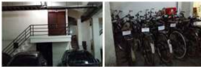
Figure 8 The parking space in the basement

This floor is used for parking space of the Directors' and Employees' cars and motorcycles, storage area, toilets and janitor space, building pump and electricity generator space. The floor design is based on the original building design (Figure 8).