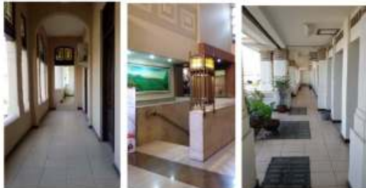
Figure 10 The physical of PTPN X building finishing

All the physical building finishing was customized to the Dutch colonial building original design. Authentic ornaments were applied to the building walls with synergic glass colors and patterns. All of the Dutch colonial heritage furniture is still functioning properly, including the safe for storing the company documents and the large cupboards for the plantation office archives that are located on the first and second floor. The finishing of the entire building includes the space for the sanitary and plumbing systems, which was done in accordance with the original building finishing (the design in Figure 10).