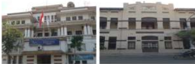
Figure 11. The Roof of PTPN X building/Source of observation research.

One of the tips to further improve the credibility of the existence of cultural heritage buildings, as well as to use it for the benefit of important and potential education and cultural heritage especially for students of architectural programs, is to push the government to protect and preserve the heritage buildings such as PTPN X and etc. in Surabaya.