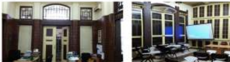
Figure 9 The head division office and meeting room.

On this floor, there are many building spaces with different functions that were rebuilt based on the original building design, such as space for the Head Division office and staff rooms, Meeting rooms, Procurement and Project Activities space, storage space for important documents which was formerly a hidden bunker, and other functions such as a warehouse of records, janitor area and toilets. The new floor was rebuilt with an enhanced security system and it was rebuilt in accordance with the original floor design and with the same building functions (Figure 9).