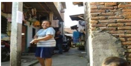
Figure-3. The shared space of low income flats environment (Karang Turi, Gresik).

According to the expert's statement, that stated, "Public rest rooms are microcosm of urban life, offering excitement and repose, markets and public ceremonies, a place to meet friends. The space remained an open space, not only to accommodate crowds, because it also served as a place for ceremonies and sporting events" (Webb, 1990). The shared space of flats environment outside building can describe as a microcosm that is part of the universe (the flats environment), which is implemented meets all the needs of the low-income-society to live.