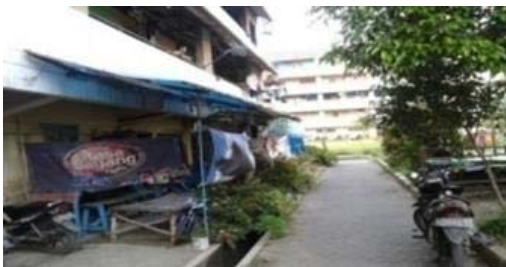
Figure-2. The shared space of low income flats environment (Warugunung, Surabaya).