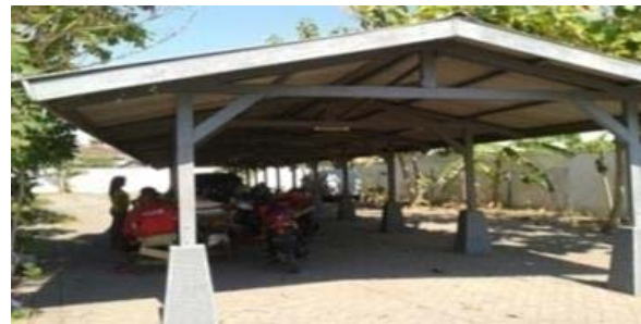
Figure-4. The shared space of low income flats environment (Gulomantung, Gresik).

The definition of low income flats in Indonesia that stated "It is a multi-storey building, built in an environment, which is divided into sectional and functionally structured in horizontal and vertical direction. The units can be owned and used separately, especially for dwellings equipped with common parts, shared objects and common ground" (Undang-Undang RI no. 16, 1985). The Contents showed that the high rise building have two facilities including private and common facilities. The togetherness of low income people can be applied in common facilities, not only for outside the building but also inside of it. And the research studies just about in outside of flats building only.