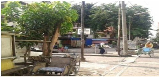
Figure-5. The shared space of low income flats Environment (Sombo, Surabaya).

The depth study includes reviewing and analysing the placement of shared space of the flats environment outside building, in the context of behaviour and culture flow-income-occupants. The basic theories will be used for research background that equivalent for flat's environment. And the result theories are included "the placement of shared space in environment of low income flats outside the building.