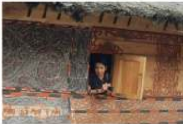
Figure 7. The wall of a house with a pattern

Banua Ginjang is the topmost part of Toba Batak house and as a symbol of the place of the gods. The roof covering material uses fibers from palm fiber, thus the heat from the roof does not propagate into the room (figure 8).