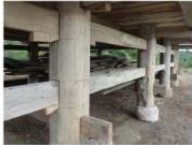
Figure 2. Banua Toru

The construction system at Banua Toru uses a column of round-cylindrical logs arranged in a row around the house plan. The distance between these columns is + 0.8 to 1 meter in diameter from the logs + 25 - 30 cm. Column height + 160-170 cm. The rods of this column are assembled using wooden planks with a size of + 3.5 x 18.5 cm. The beam column connection system uses the pen hole technique. The pedestal of these columns is only a pedestal of stone. This series of column connections is like a fence that surrounds a house plan. Multifunctional construction . The construction of Banua Toru serves as a sturdy and stable building support pole as well as a safety fence for pets (figure 2) .