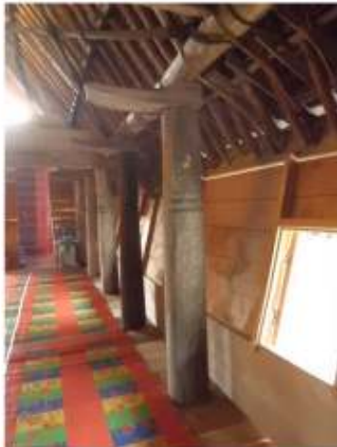
Figure 4. Banua Tonga

left and right from the side of the building (picture 5) . The Toba Batak house entrance is similar to the life cycle when leaving the house is like coming out of the womb, and vice versa when entering the house it is like returning to shelter in the mother's womb to rest with family.