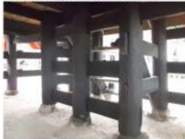
Figure 3. The tectonic system on the entrance stairs

The entrance to the Toba Batak House is through the bottom that protrudes inward, so that from the front of the building the entrance is not visible (picture 3) . In addition, the entrance to the Toba Batak house gives a sense of security because residents can see who enters the house and the transition from Banua Toru to Banua Tonga , from death to life.