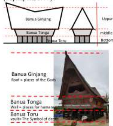
Figure 1. The division of Tri Tunggal Banua

The Toba Batak house is an expression and embodiment of a belief, ideals, hopes and outlook on life. Toba Batak house describes about; first: a description of the cosmological order, second: as a place for a family to live, and third: a source of abundance of blessings (Simamora, 1997). The cosmological order of Ruma Batak Toba consists of a macrocosm and a microcosm consisting of the "Tri Tunggal Banua" (figure 1), namely: Banua Toru (bottom), Banua Tonga (middle), and Banua Ginjang (top). Banua Toru is represented by under the symbol of death, while Banua Tonga is represented by floors and walls, where all human activities are in the house, and finally Banua Ginjang is represented in the form of the roof of the house where the Gods live (Napitupulu, 1997).