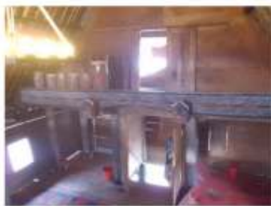
Figure 5. The walls in the Toba Batak house

Toba Batak house does not have a ceiling, so when you enter the atmosphere the room feels spacious, because the height of the roof from inside the room can reach 5 - 6 meters. The front above the entrance there is a room for music as well