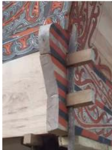
Figure 6. Tectonics of a peg hole in the wall

The wall connection system uses a hole connection which is then pinned (figure 6) . Connections between boards do not use nails, because the use of nails is a taboo for Toba Batak house .