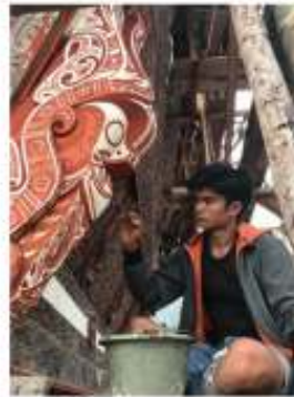
Figure 9. The ornaments of Toba Batak house