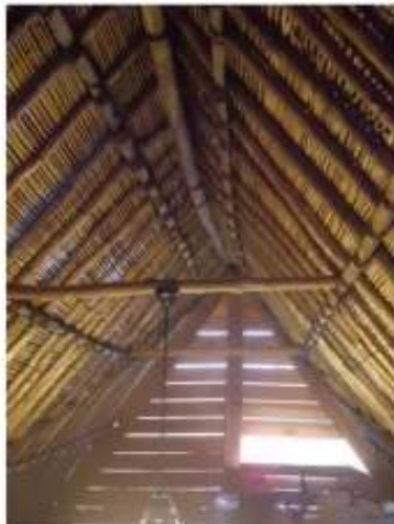
Figure 8. Banua Ginjang

The connection system on the roof uses a tie and weave system. Toba Batak house do not use trestle like in general today's houses . Wood is selected from solid wood along 9 meters, strung from one end to the other.