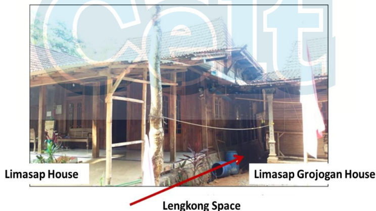
Figure 2: The Lengkong space between the Omah Limasap and Omah Limasap Grojogan (Setiohastorahmanto, 2023)

The Lengkong space is used by residents to shorten the distance and travel time, as well as animals that are used to passing will routinely cross the Lengkong . This is used by cattle herders. buffalo or goat to pass after finishing grazing. It is possible that wild animals also crossed.