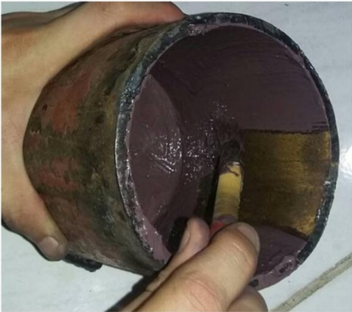
Fig. 1. Steel crucible coating.

To prevent iron diffusion to the aluminium melt, the inner wall of the steel crucible used in this work was coated prior to melting process (Figure 1). Iron diffusion to the aluminium should be prevented since iron deteriorates mechanical properties of aluminium alloys [3].