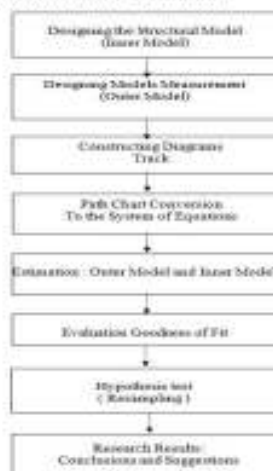
Figure 1. framework of thought

There is a framework of thought in this study as follows :