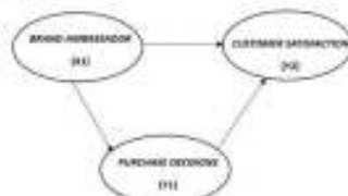
Figure 2. Conceptual Framework

Then the conceptual framework is as follows: