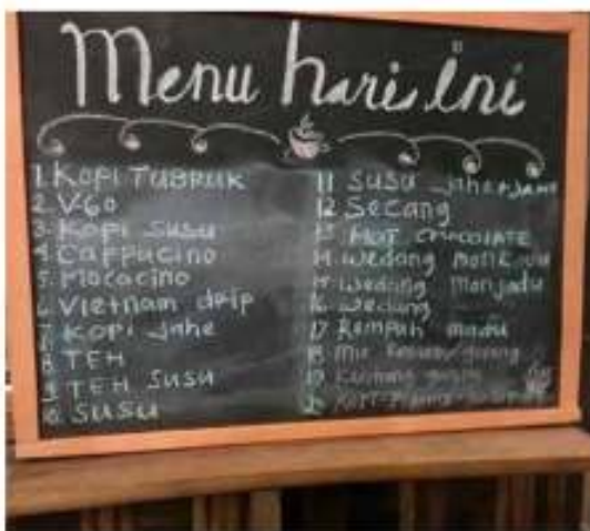
Fig. 1. One of the banners shows the price list of the Café 'Cempaka Kedai Hutan'

Currently, it was found that there are more than six enterprises in the location where some data was collected for this research, i.e., café 'Cempaka Kedai Hutan' media humans (figure 1), 'POJOK DAYU' gift and snack's store (figure 2), banana farming (figure 3), goat farm (figure 4), chicken farm, a shop of various crops and flowers, live music show, camping, and its supported facilities with ATV (All-Terrain Vehicle), outbound, archery, and unique paintball.