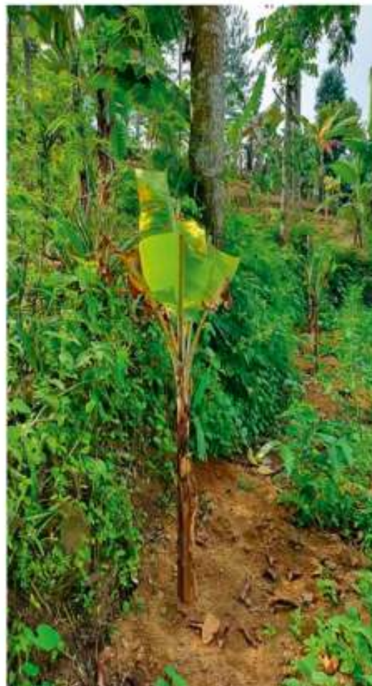
Fig. 3. Banana Farming