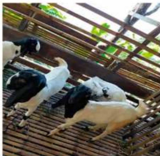
Fig. 4. Goat Farm