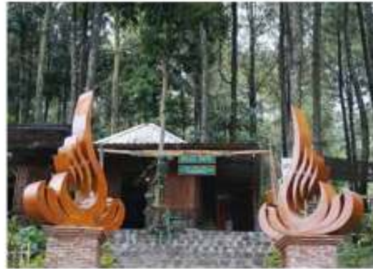
Fig. 2. POJOK DAYU gift and snack's store ( https://cempakafoundation.org )